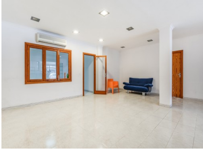
Access to a further room