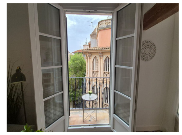
View to Plaza Cort