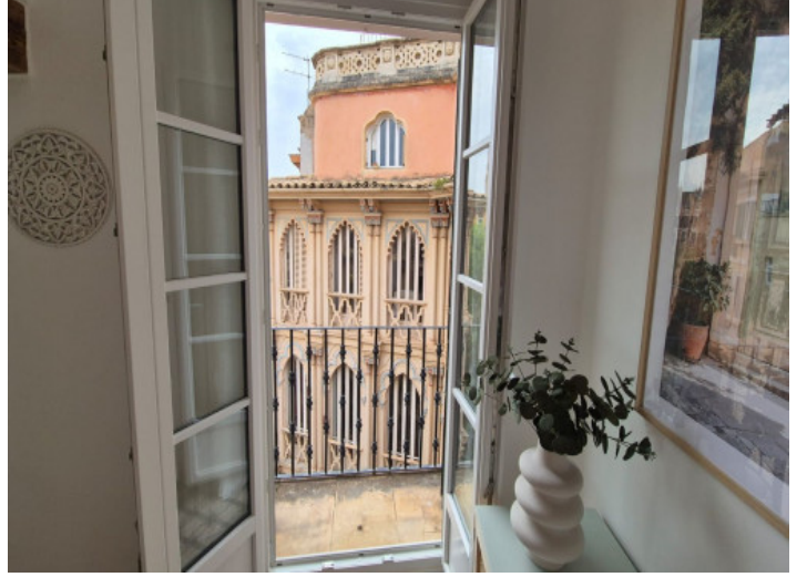
View to Plaza Cort

All information is correct to the best of our knowledge. Errors and prior sale excepted. This prospectus is purely for information purposes. Only the notarized deed of sale is legally binding.