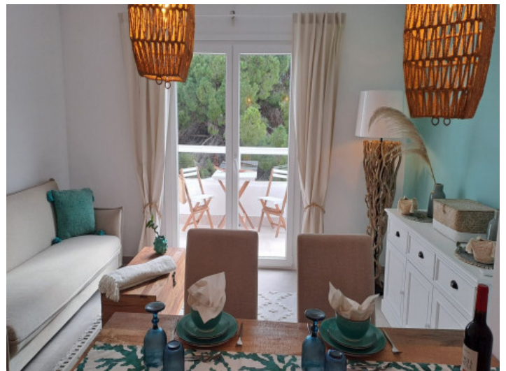
Living area flooded with light

All information is correct to the best of our knowledge. Errors and prior sale excepted. This prospectus is purely for information purposes. Only the notarized deed of sale is legally binding.