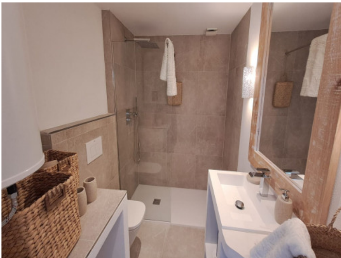
Fantastic shower room