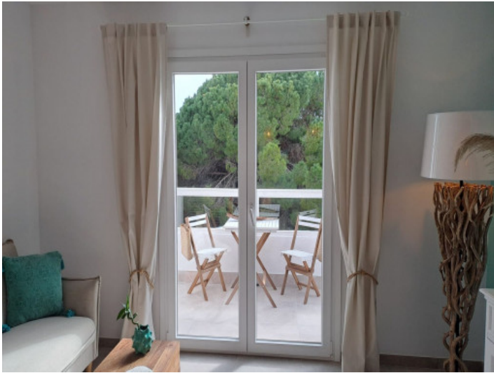
Living area with access to the balcony