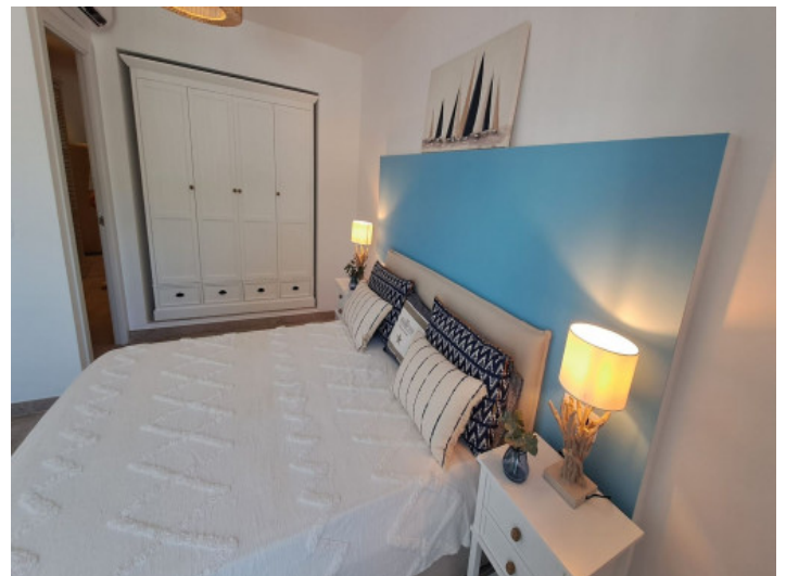
Bedroom with free-standing wardrobe

All information is correct to the best of our knowledge. Errors and prior sale excepted. This prospectus is purely for information purposes. Only the notarized deed of sale is legally binding.