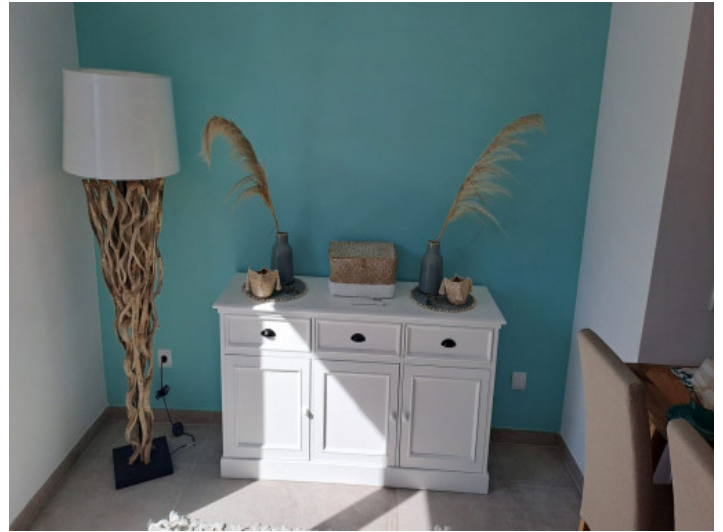
Lovingly furnished flat