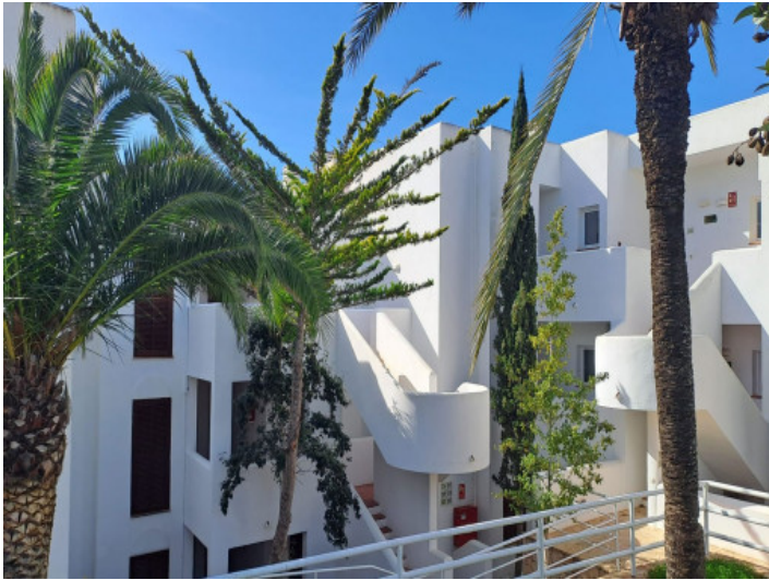
Well-kept residential complex