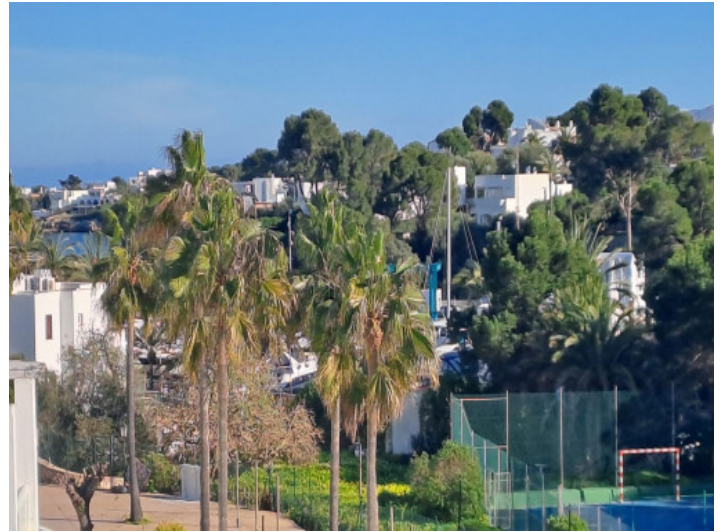
Walking distance to the harbour of Cala d'Or