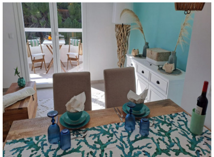
Open-plan living and dining area

All information is correct to the best of our knowledge. Errors and prior sale excepted. This prospectus is purely for information purposes. Only the notarized deed of sale is legally binding.