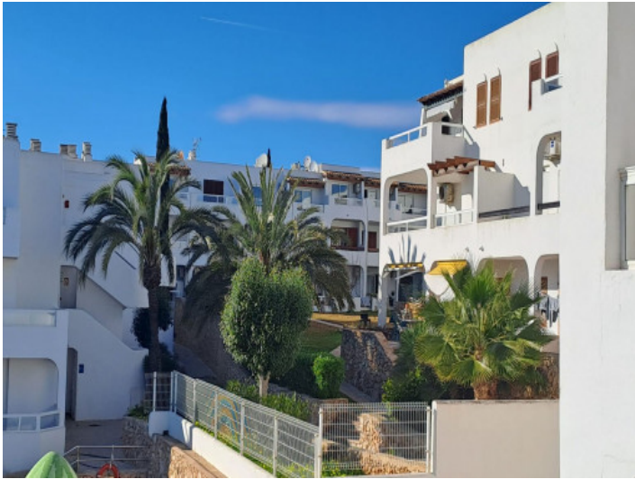
Mediterranean residential complex