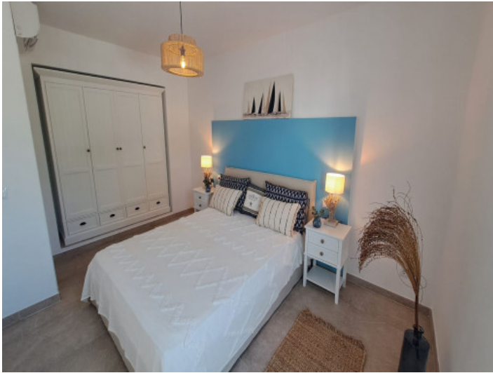
Large double bed