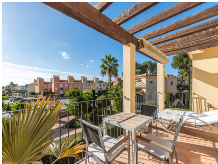
Terrace with views