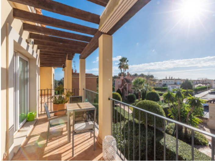
Terrace with views