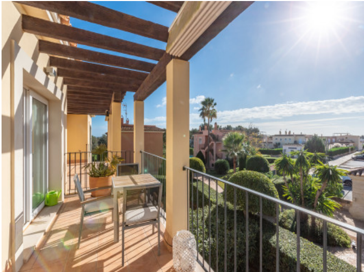
Terrace with views