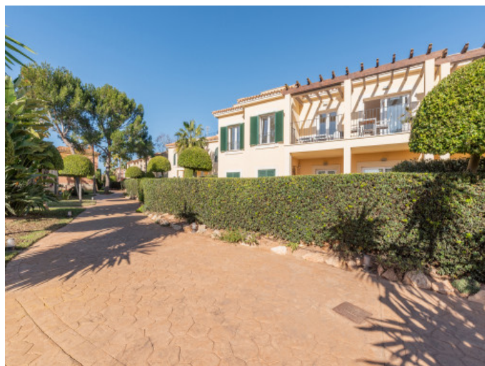
Fassade and community garden

All information is correct to the best of our knowledge. Errors and prior sale excepted. This prospectus is purely for information purposes. Only the notarized deed of sale is legally binding.