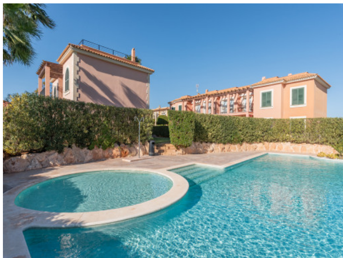
Beautiful community pool