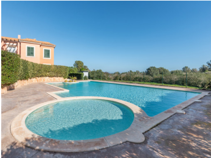
Very well maintained pool