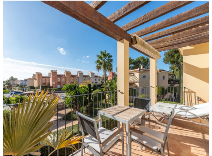
Terrace with views