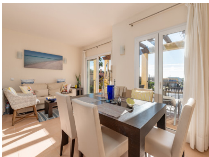
Bright living and dining area