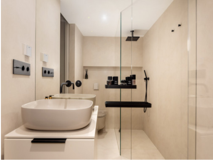
Modern bathroom with walk in shower