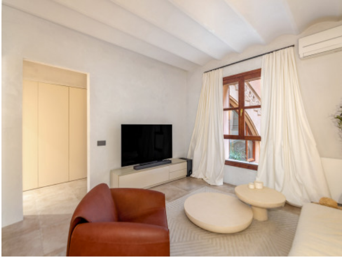
Beautiful living area