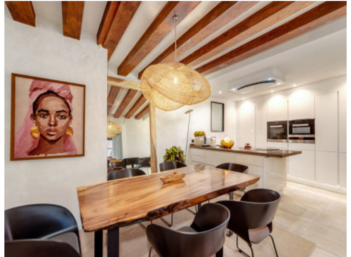
Beautiful dining area