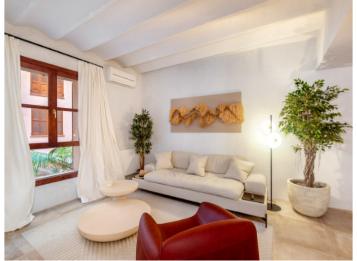
Elegant living area