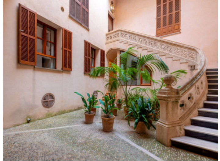
Typicla mallorcan patio