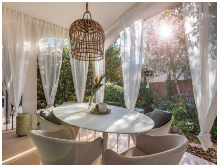
Lovely covered terrace