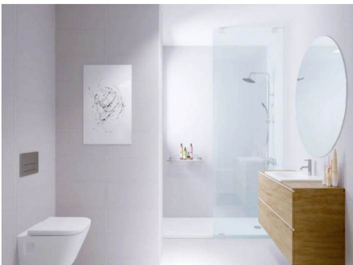
Two modern bathrooms