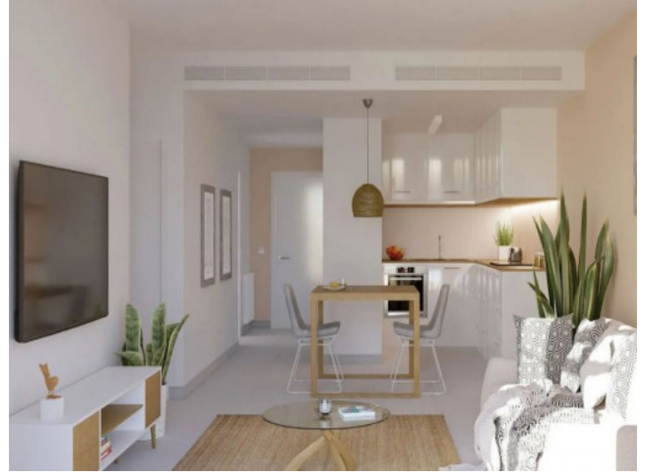
Bright living area