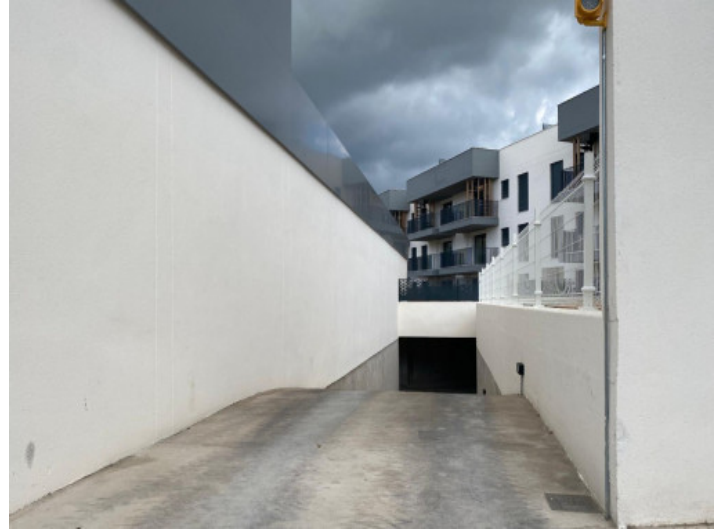
Access to the underground car park