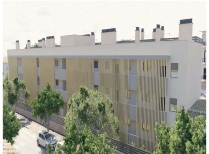
Close to the beach