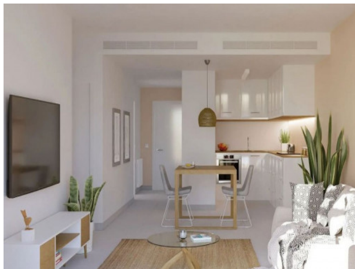
Bright living area