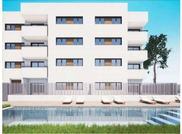
Penthouse with private pool in Cala Ratjada