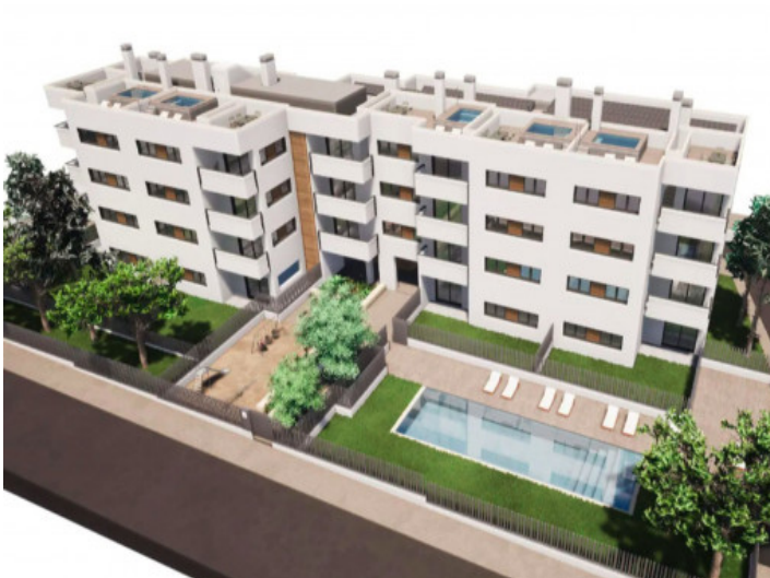
Garden with pool