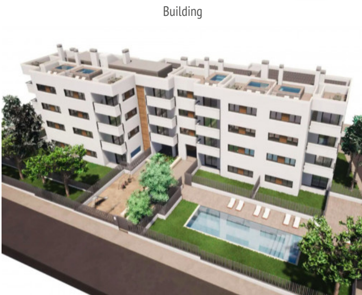
Garden with pool