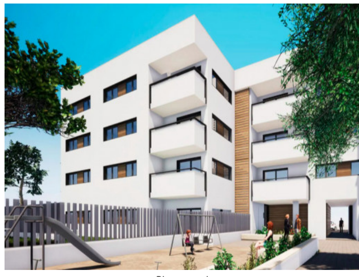
Garden with pool Playground All information is correct to the best of our knowledge. Errors and prior sale excepted. This prospectus is purely for information purposes. Only the notarized deed of sale is legally binding.

PORTA MALLORQUINA • C./ CONQUISTADOR 8, 07001 PALMA TEL. +34 971 698 242 • INFO@PORTAMALLORQUINA.COM