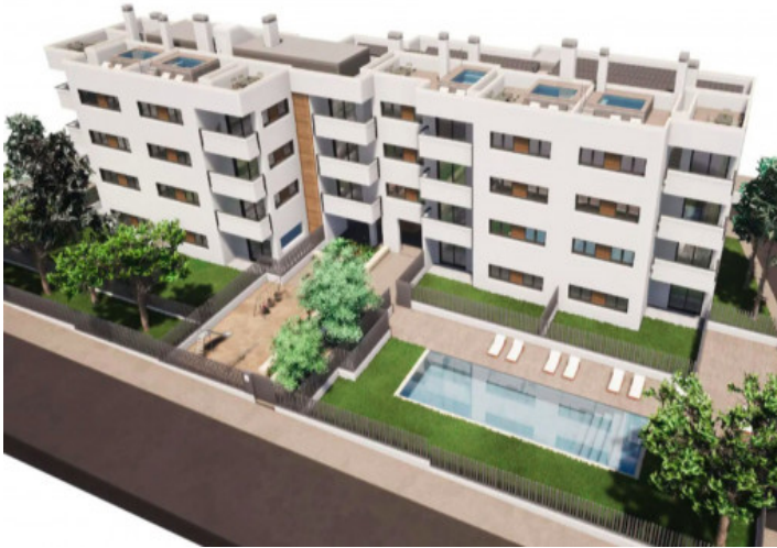
New residential complex with communal pool & playground in Cala