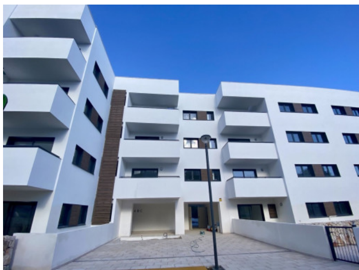
Entrance area and façade