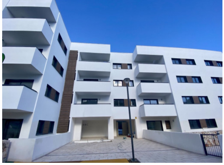
Entrance and façad3e