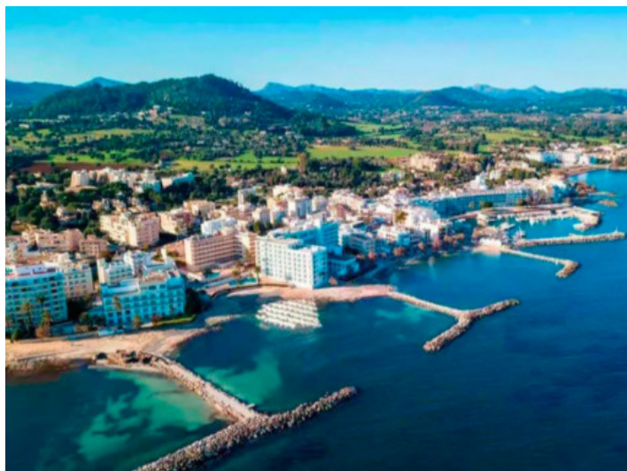
Modern condominiums in Cala Bona - living in an attractive location near