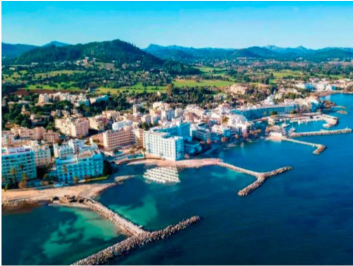
Modern condominiums in Cala Bona - living in an attractive location near