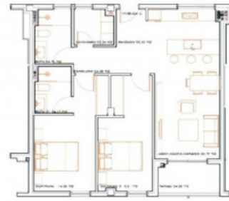
Escala de la calificación energética