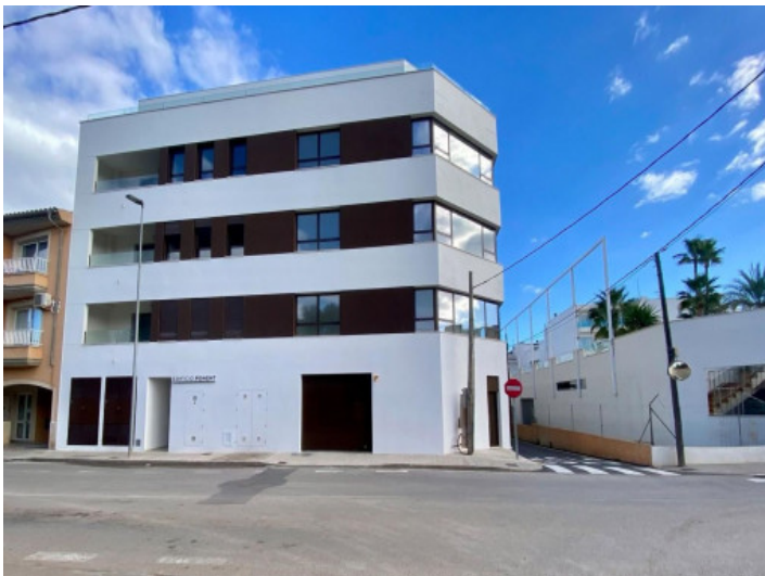
View to the building