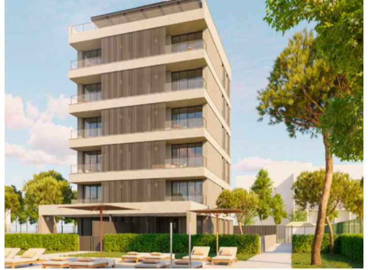
Parking and storage room