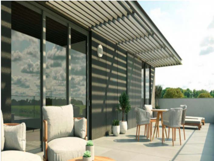
Bright flat with terrace