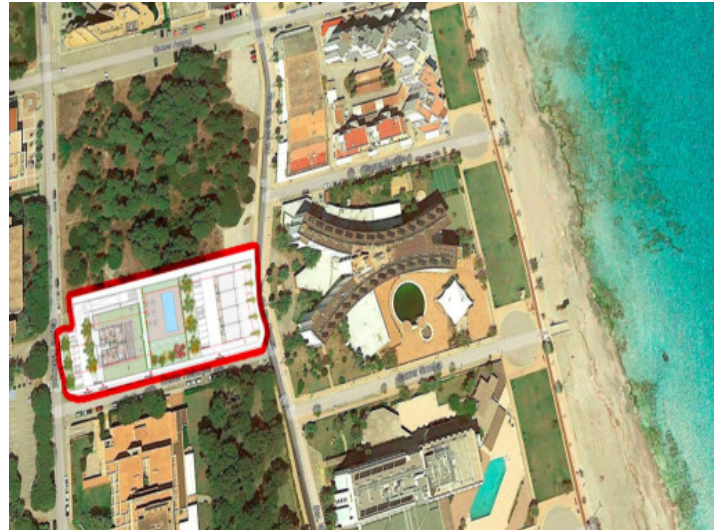
Close to the beach