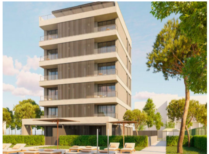
Newly - built