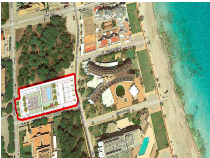
Close to the beach