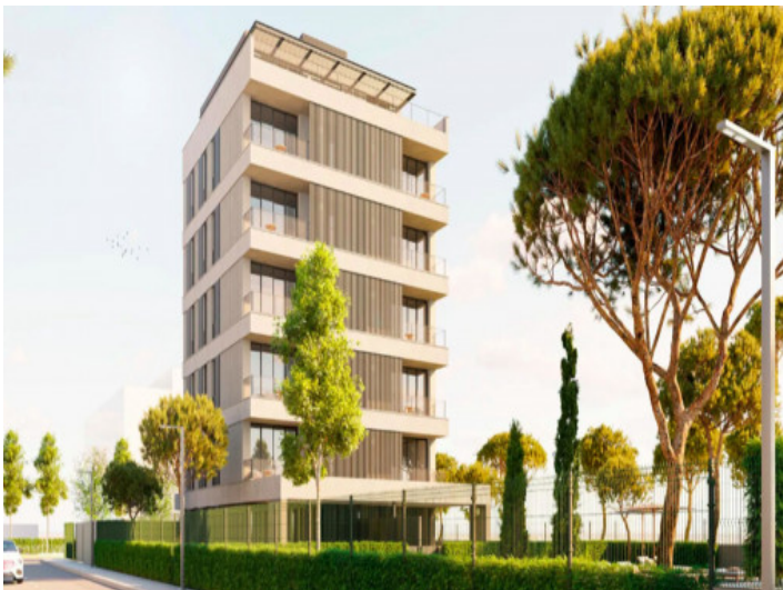
Underground parking and storage room