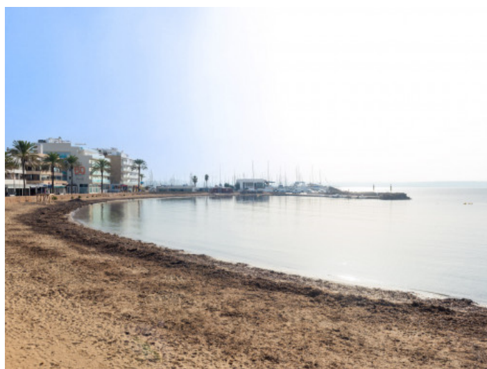
The beach is on your doorstep

All information is correct to the best of our knowledge. Errors and prior sale excepted. This prospectus is purely for information purposes. Only the notarized deed of sale is legally binding.