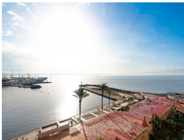
Views to the harbour