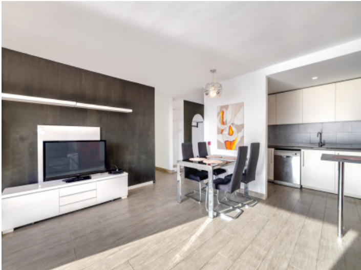
Bright living and dining area