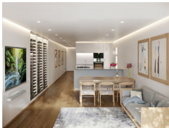
Cozy living and dining area