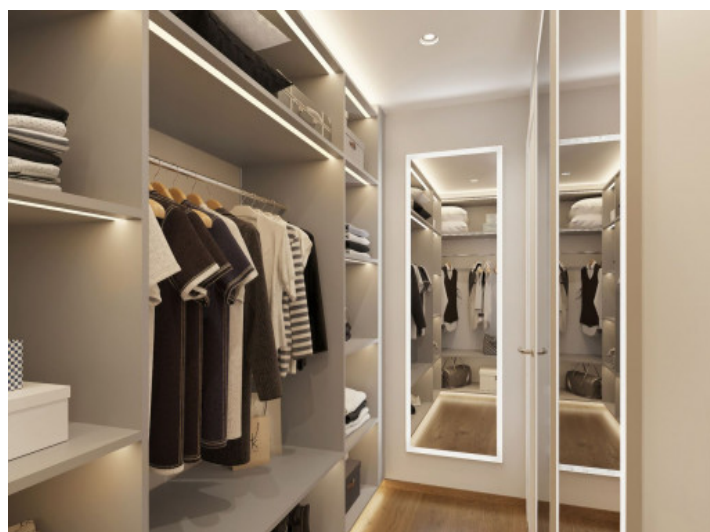
Walk in closet