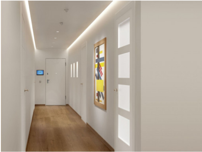
Entrance and corridor