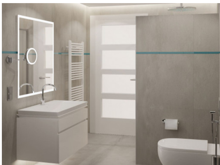
Bathroom with walk in shower