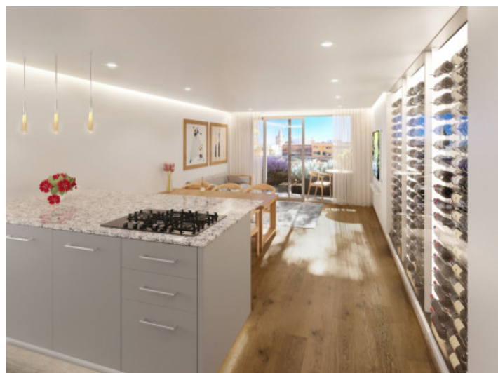
Central city location