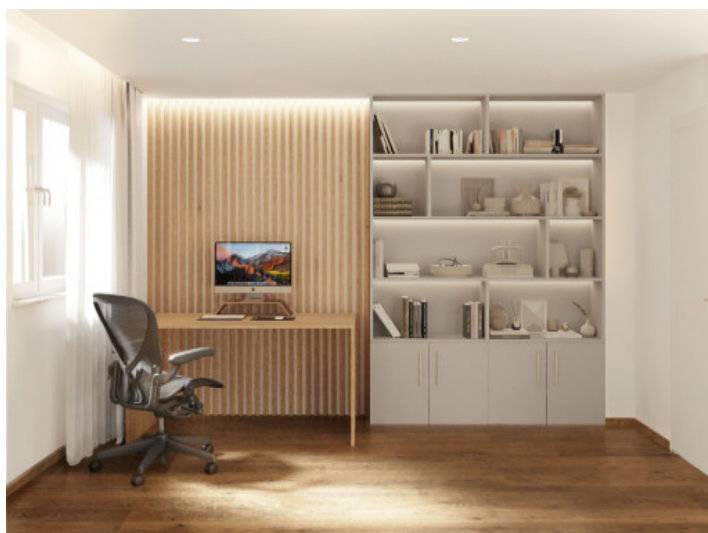
Study room or bedroom