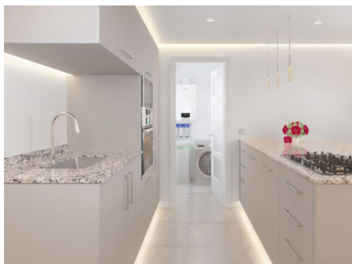
Modern kitchen and utility room