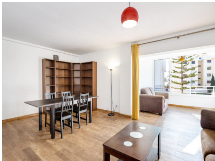
Light-flooded living and dining area

All information is correct to the best of our knowledge. Errors and prior sale excepted. This prospectus is purely for information purposes. Only the notarized deed of sale is legally binding.