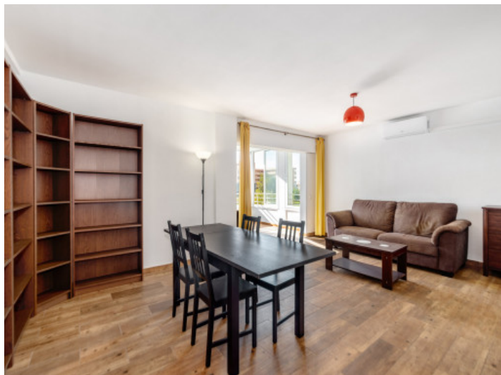
Spacious living and dining area