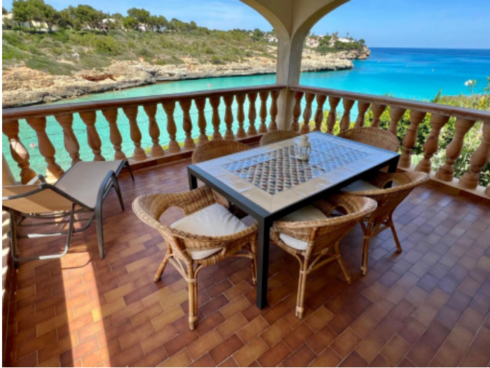
Terrace with seaviews