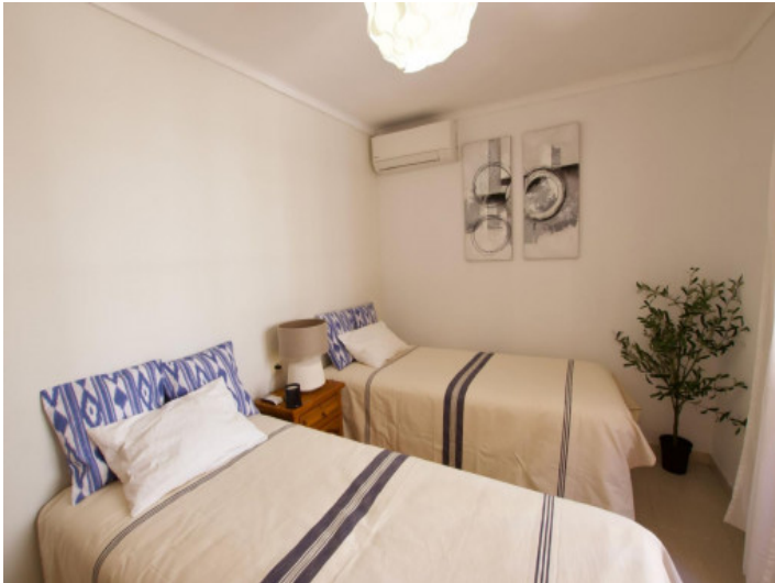
Bedrooms with air condition