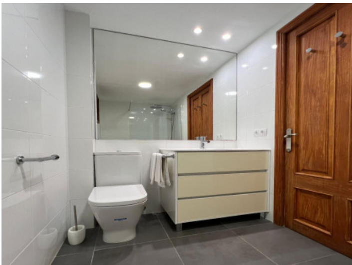
A total of 2 bathrooms