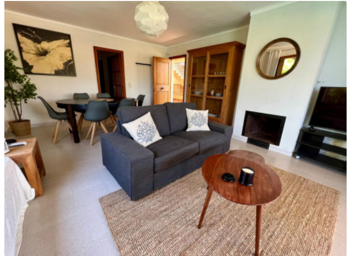
Living and dining room with fireplace