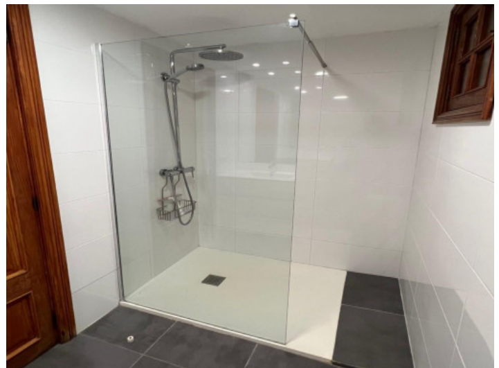
Bathroom with walk-in shower

All information is correct to the best of our knowledge. Errors and prior sale excepted. This prospectus is purely for information purposes. Only the notarized deed of sale is legally binding.