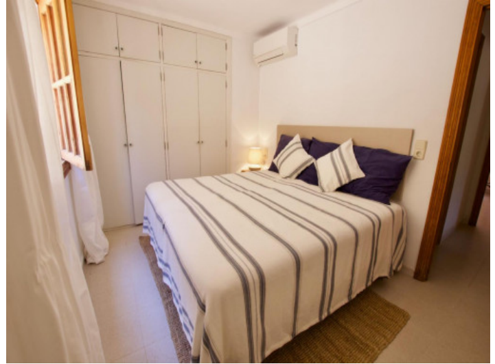
Flat with 3 bedrooms