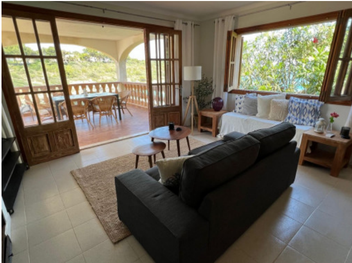
Large living area