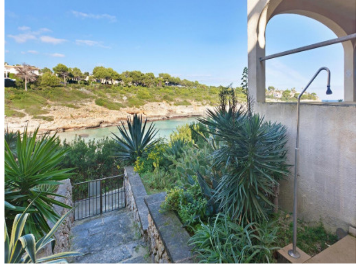
Access to the beach