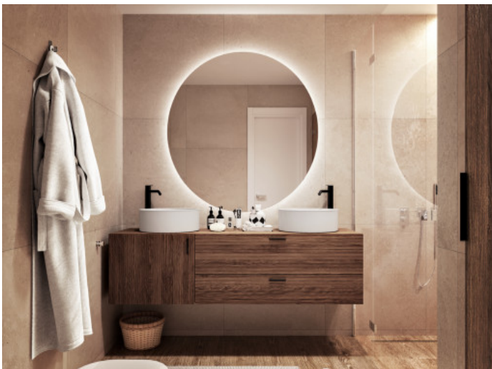
Flat with 2 bathrooms