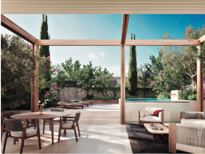
Patio with private pool