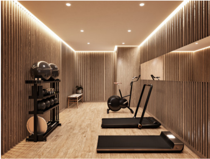
Community area with fitness area