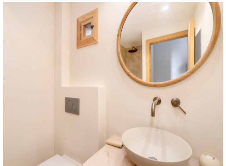
Beautifully designed bathroom

All information is correct to the best of our knowledge. Errors and prior sale excepted. This prospectus is purely for information purposes. Only the notarized deed of sale is legally binding.