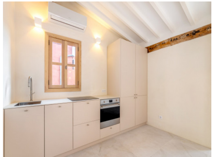
Modern kitchen with appliances