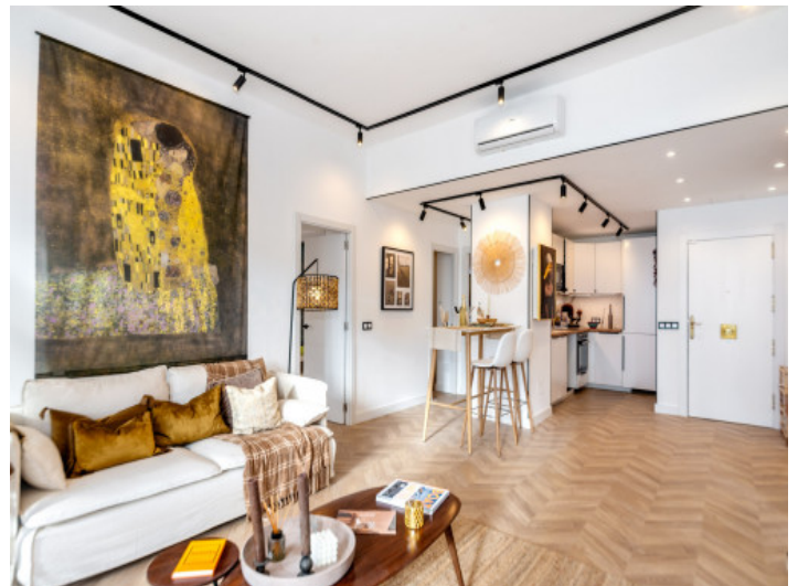
Open room layout