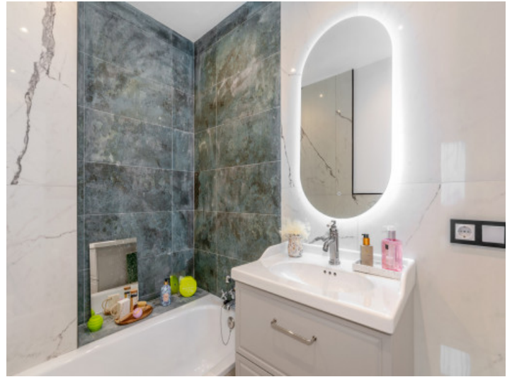
Bathroom en suite