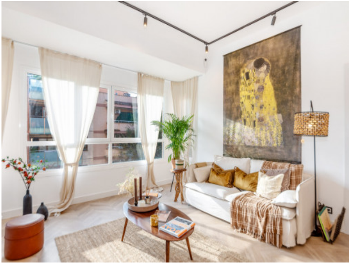
Bright living area