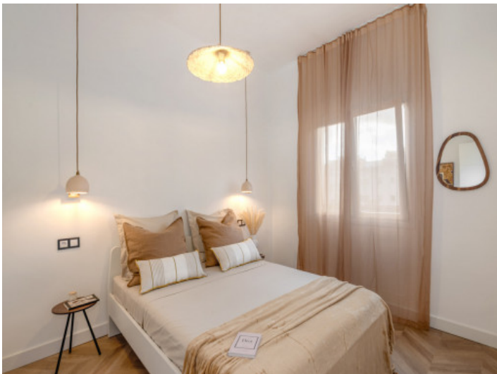
One of 3 bedrooms