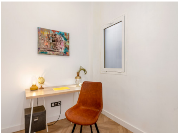
Study room or bedroom