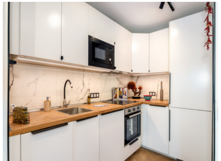
Fullu equipped kitchen

All information is correct to the best of our knowledge. Errors and prior sale excepted. This prospectus is purely for information purposes. Only the notarized deed of sale is legally binding.