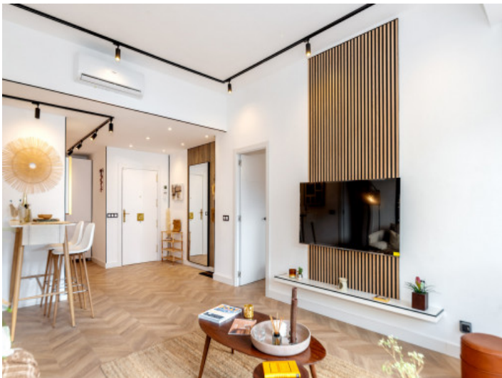
Living and entrance area