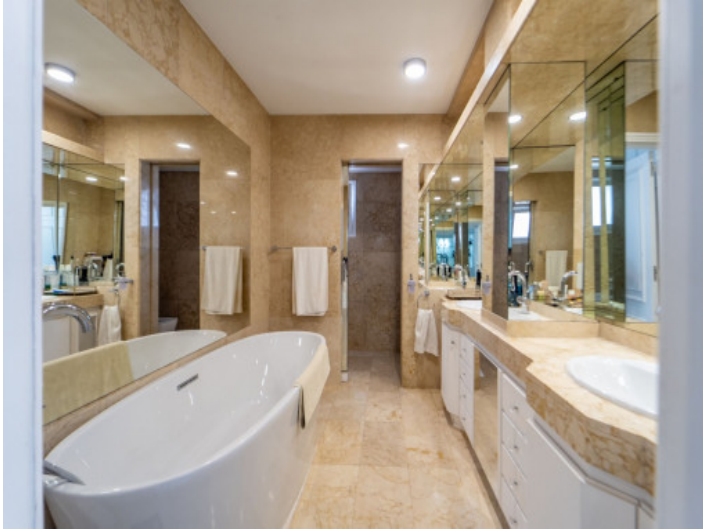
Penthouse with 4 bathrooms