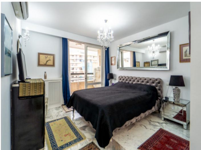
One of 5 bedrooms