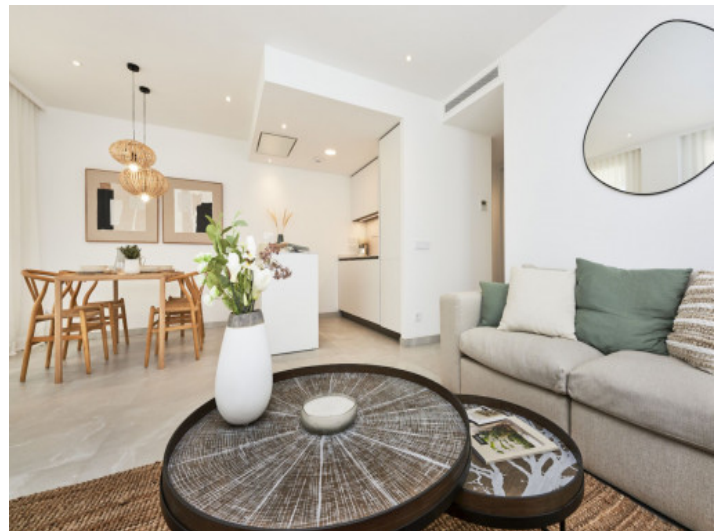
Open plan living and dining area