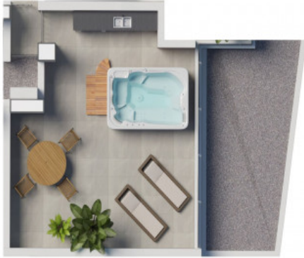
Floor plan of the roof terrace