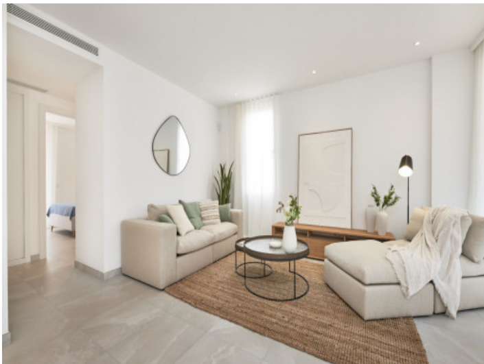
Another view of the living area