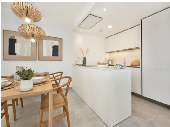
Modern, American kitchen