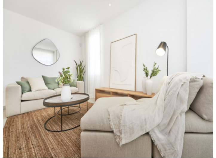
Light-flooded living area