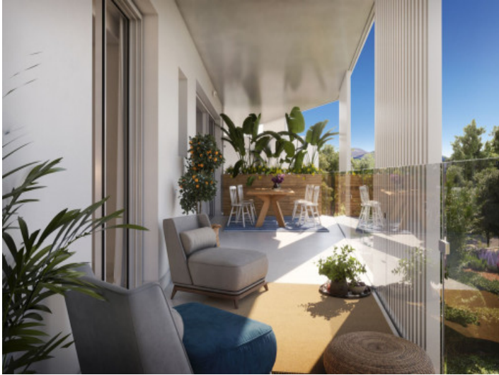
Beautiful covered terrace