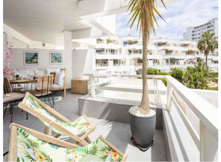
Large covered terrace