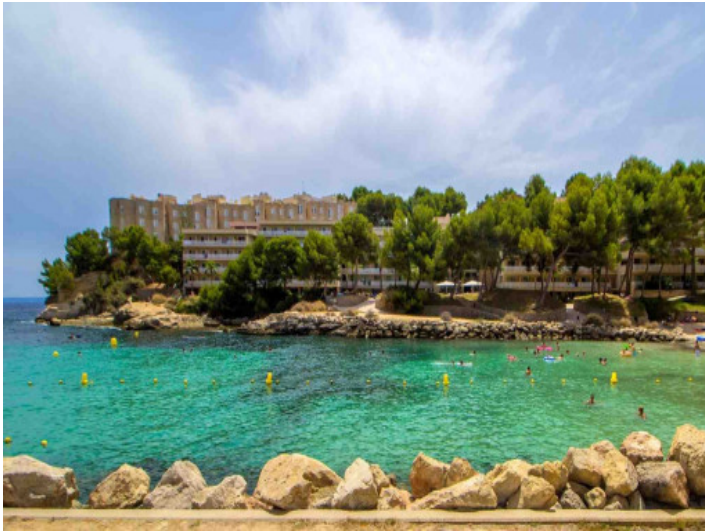
Close to the beach