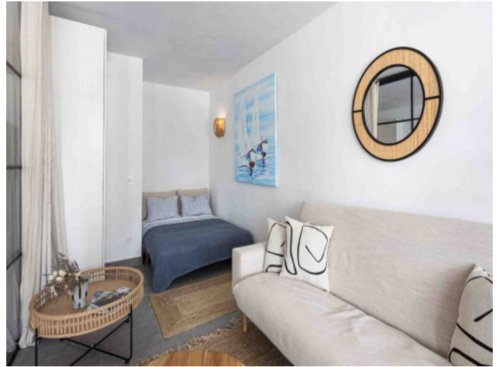
Living area with guest bed

All information is correct to the best of our knowledge. Errors and prior sale excepted. This prospectus is purely for information purposes. Only the notarized deed of sale is legally binding.