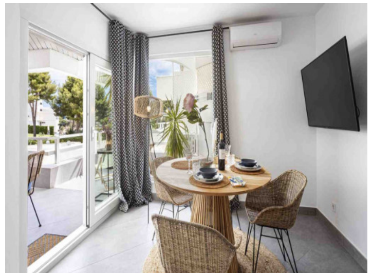
Comfortable dining area

All information is correct to the best of our knowledge. Errors and prior sale excepted. This prospectus is purely for information purposes. Only the notarized deed of sale is legally binding.