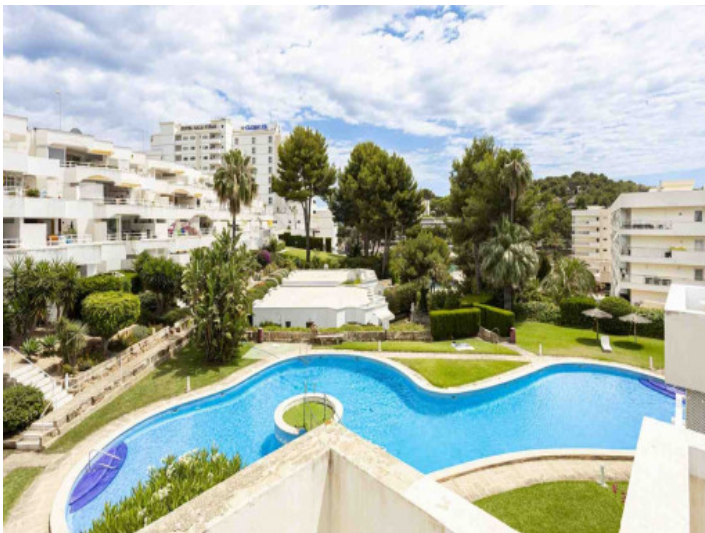
Community garden and pool area