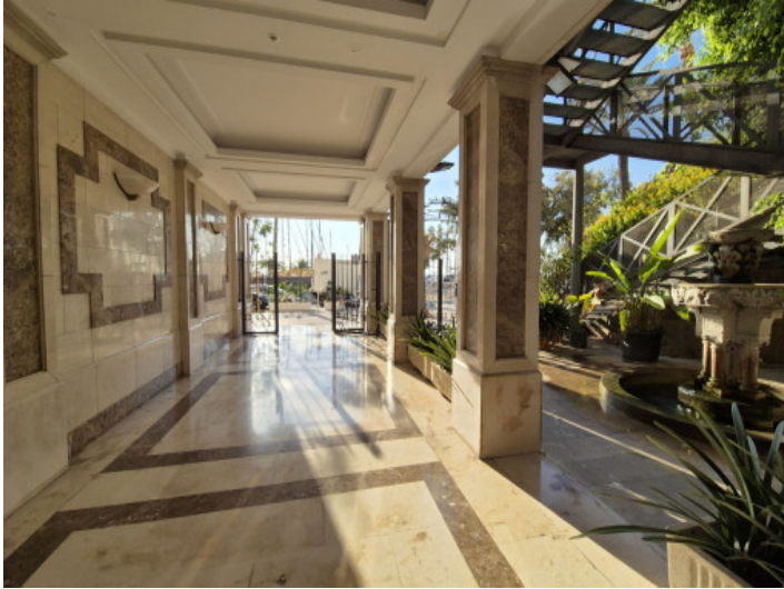
Main entrance of the building