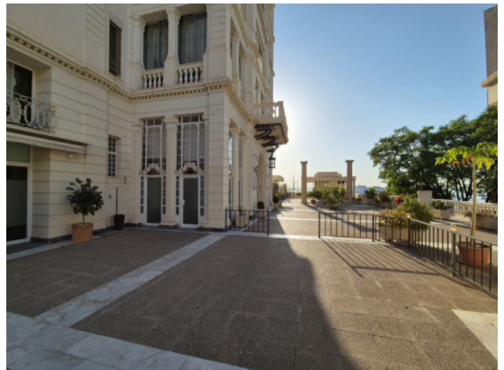
Entrance area of the building

All information is correct to the best of our knowledge. Errors and prior sale excepted. This prospectus is purely for information purposes. Only the notarized deed of sale is legally binding.