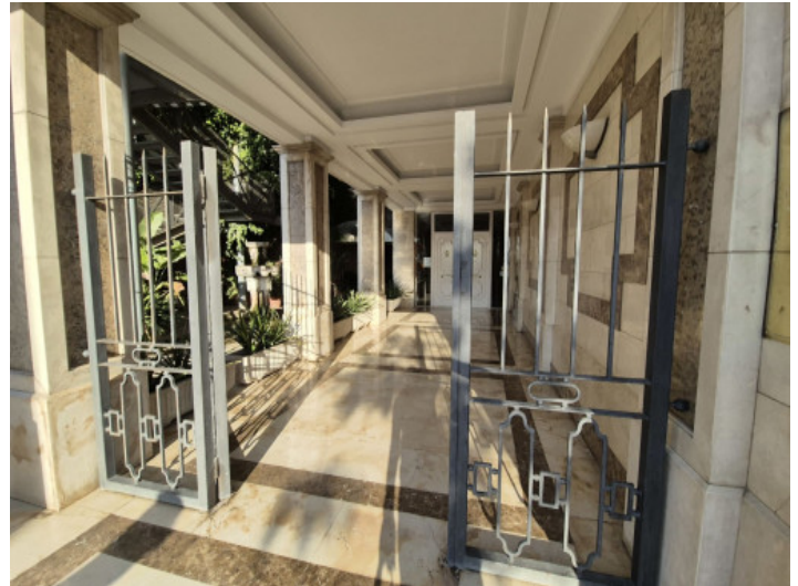
Entrance of the building