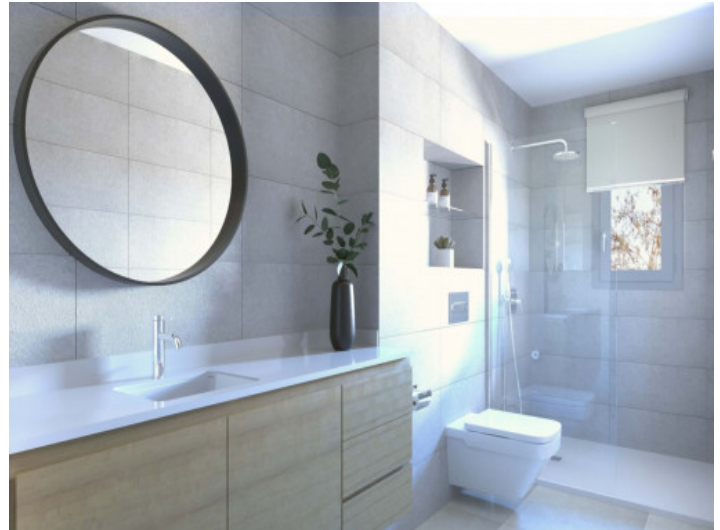
The flat offers 2 bathrooms