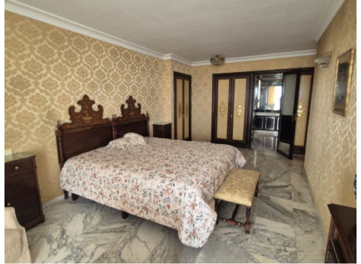
One of 4 double bedrooms