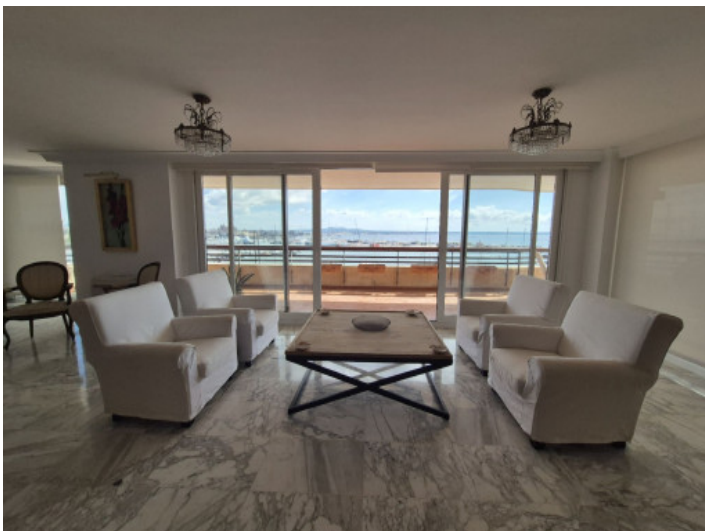
Living area with sea views