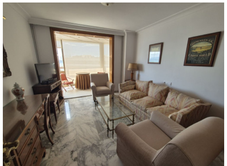
Study room or bedroom

All information is correct to the best of our knowledge. Errors and prior sale excepted. This prospectus is purely for information purposes. Only the notarized deed of sale is legally binding.