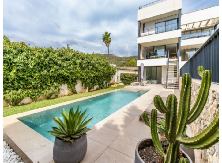
Pool and garden