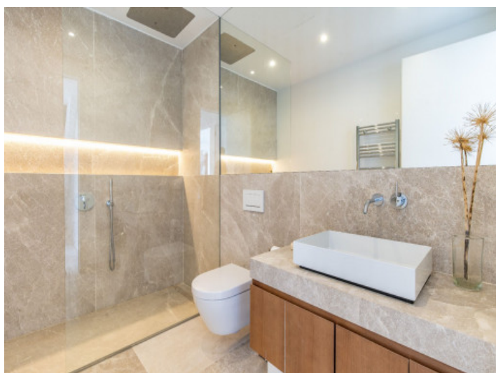
Bathroom with walk-in shower