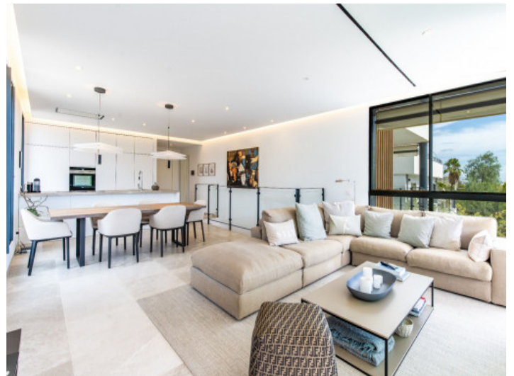
Open room layout