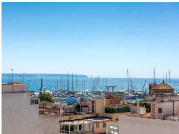
Mediterran sea views