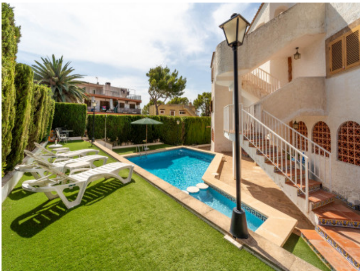
Garden and pool