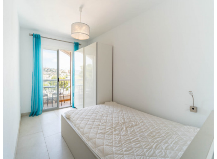
One of 3 bedrooms