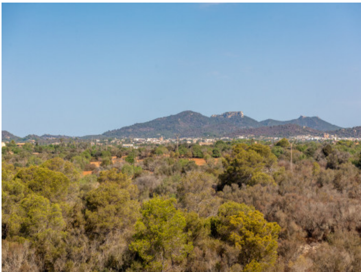
Views to Sant Salvador