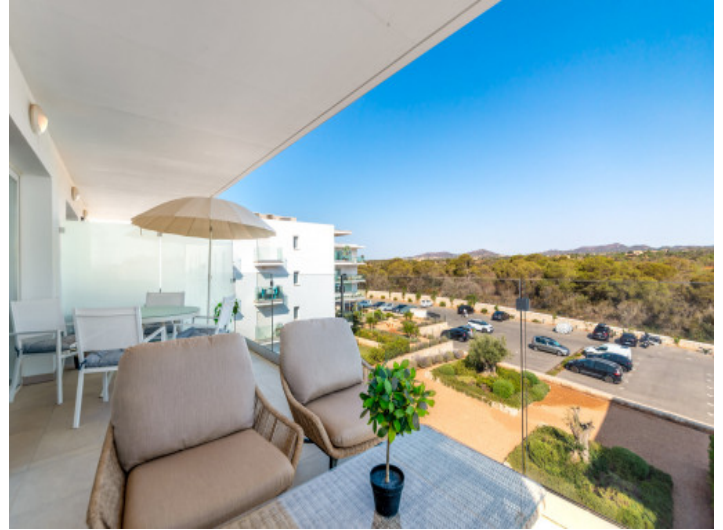
Terrace with far-reaching views