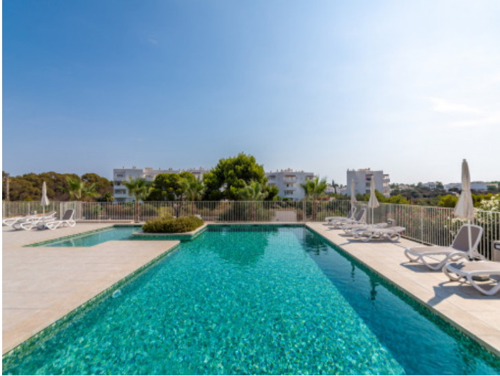
Large community pool