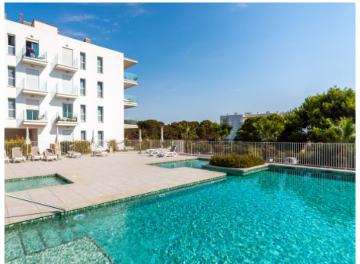
Facade and pool