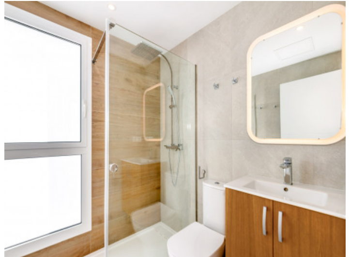
Bathroom with walk - in shower