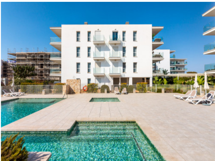
Facade and pool