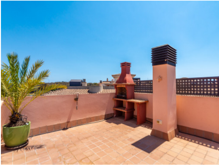
Rooftop terrace with BBQ