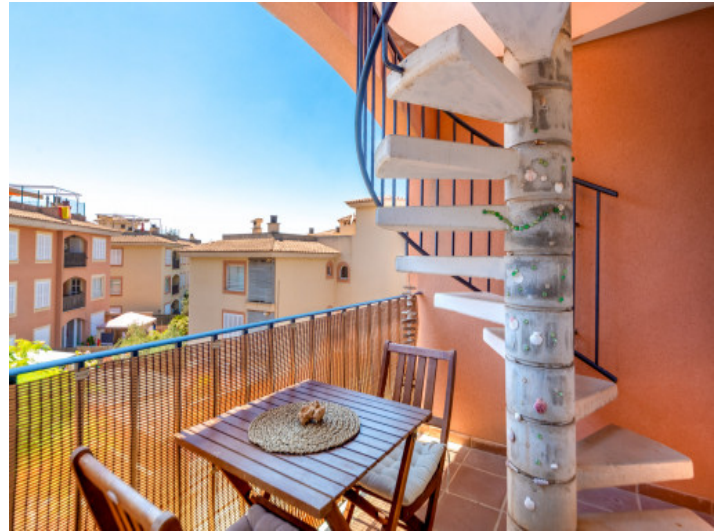
Balcony and access to the rooftop