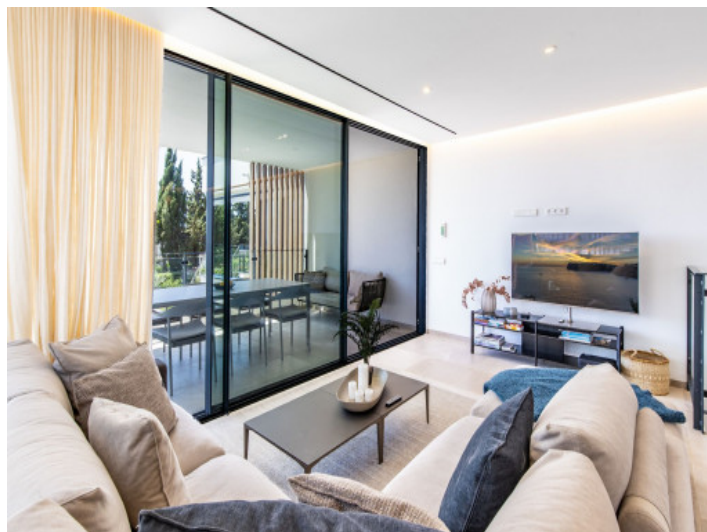
Comfortable living close to Palma city center