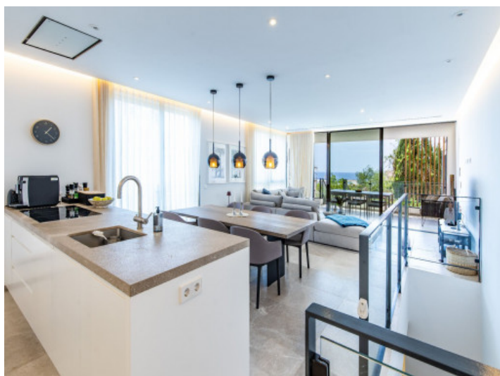
Living, dining and cooking