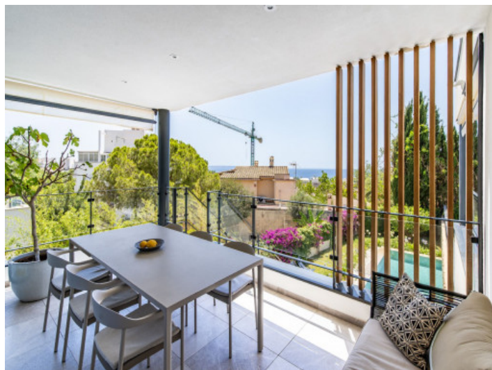
Terrace with views