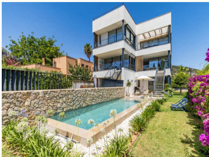
Pool and garden