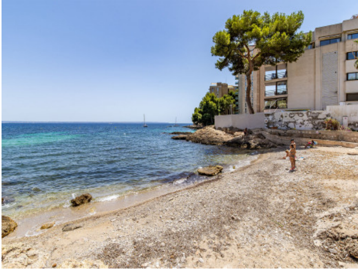
Beach on the doorstep