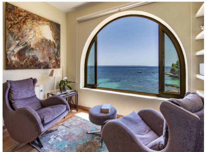
Relaxing reading corner

All information is correct to the best of our knowledge. Errors and prior sale excepted. This prospectus is purely for information purposes. Only the notarized deed of sale is legally binding.