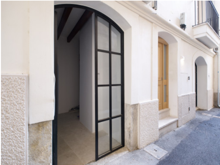
Views from the street

All information is correct to the best of our knowledge. Errors and prior sale excepted. This prospectus is purely for information purposes. Only the notarized deed of sale is legally binding.