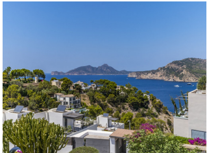
Splendid sea view