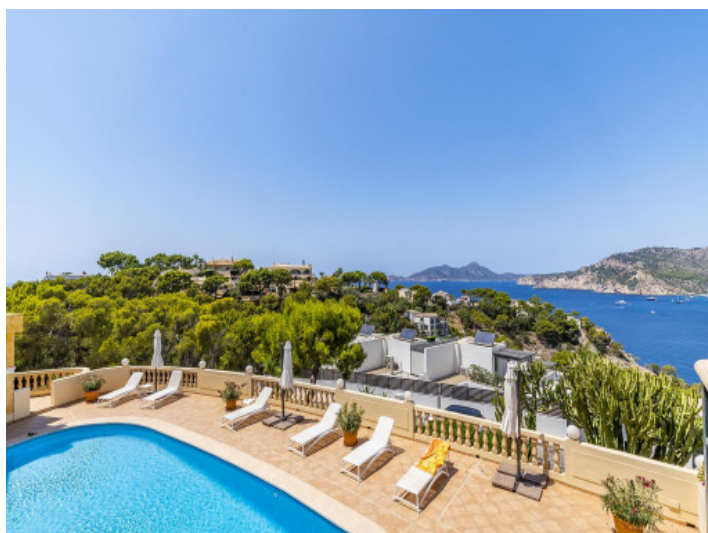
View over the pool and the sea

All information is correct to the best of our knowledge. Errors and prior sale excepted. This prospectus is purely for information purposes. Only the notarized deed of sale is legally binding.