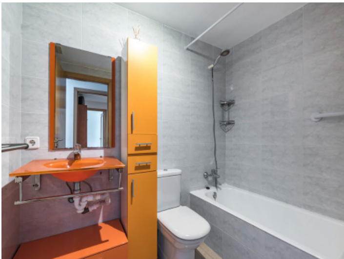
One of 2 bathrooms