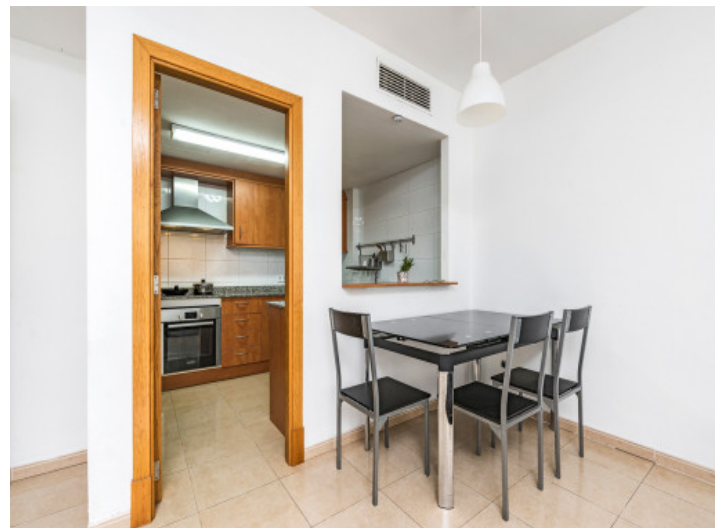
Pass-through between kitchen and dining area

All information is correct to the best of our knowledge. Errors and prior sale excepted. This prospectus is purely for information purposes. Only the notarized deed of sale is legally binding.