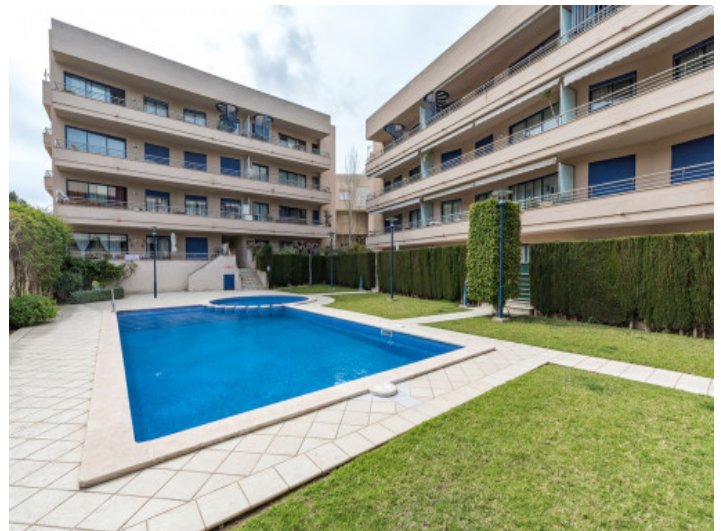
The apartment is ideal for a family