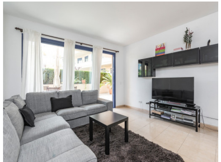
Comfortable living area with terrace access