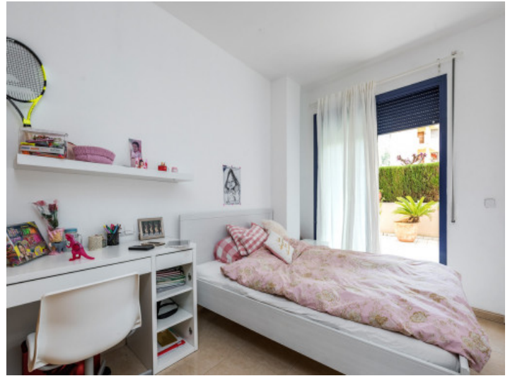
Lovely bedroom with terrace access