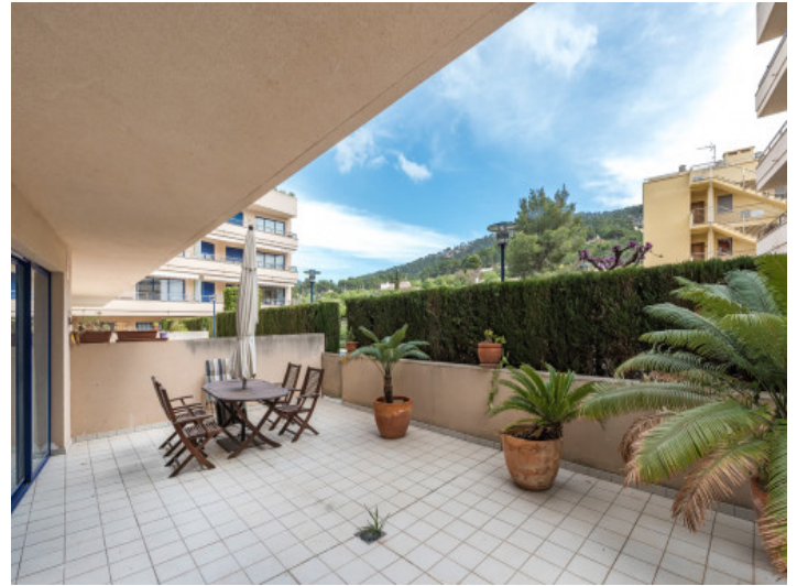
Large terrace with dining area