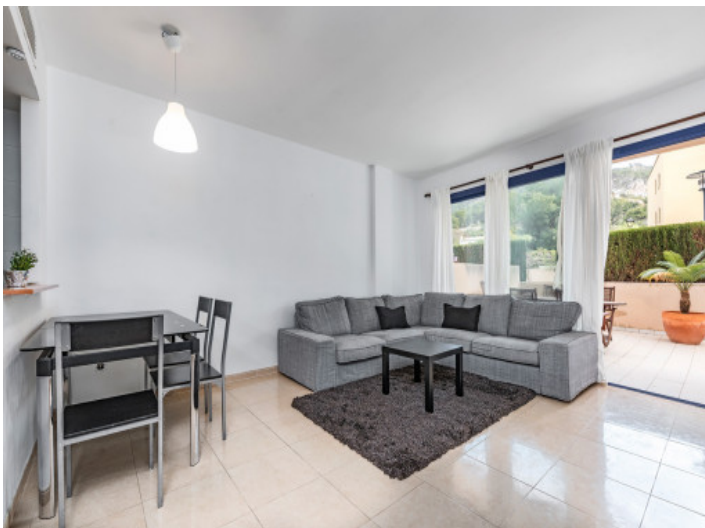
Beautiful living and dining area