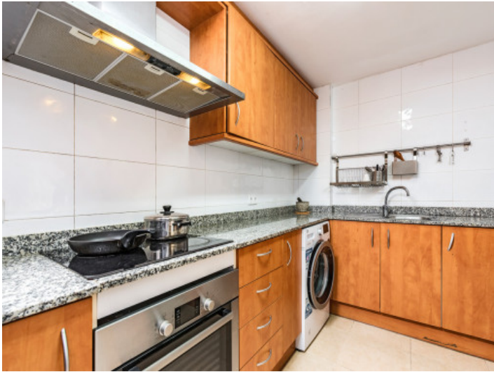
Fully equipped kitchen