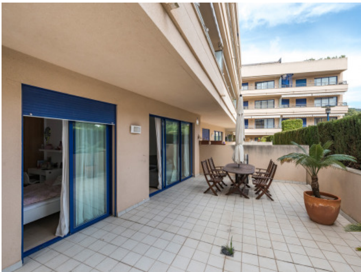
Partly covered and private terrace