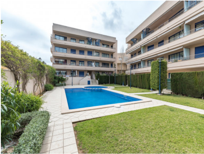
The apartment is situated in a well-tended residential complex