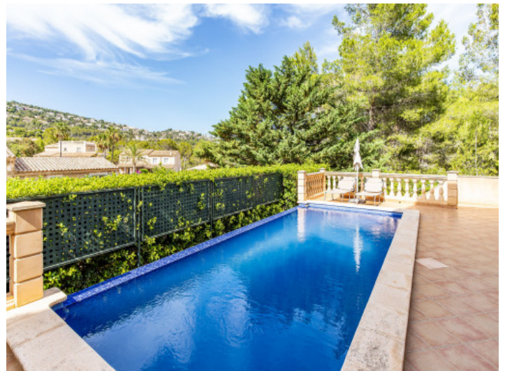
Luxurious apartment with panoramic views in Port Andratx