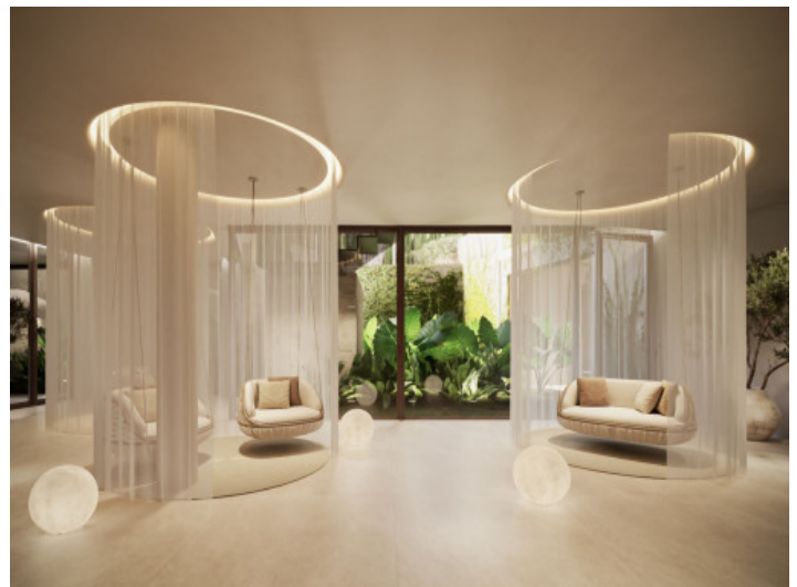
SPA entrance area

All information is correct to the best of our knowledge. Errors and prior sale excepted. This prospectus is purely for information purposes. Only the notarized deed of sale is legally binding.