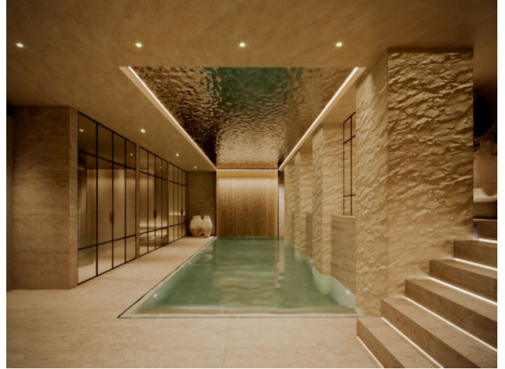
Indoorpool and SPA