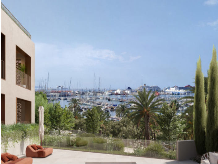
Outdoor area on the first floor