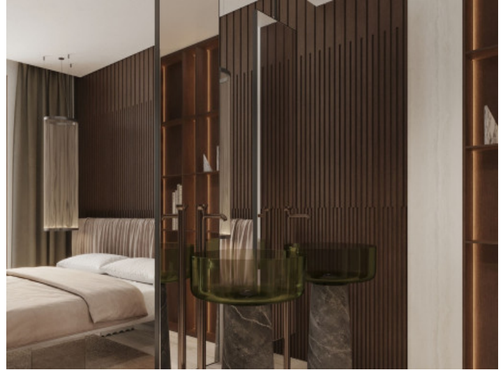
Bedroom with sink