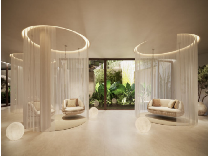
SPA entrance hall