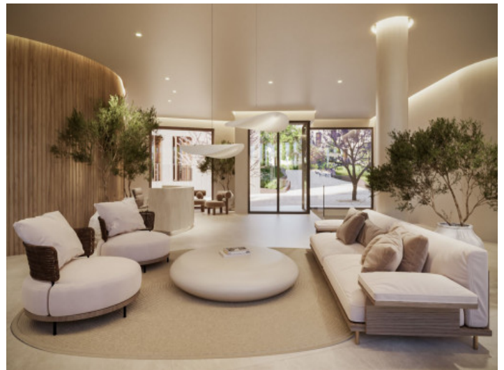
Sitting area in the entrance hall