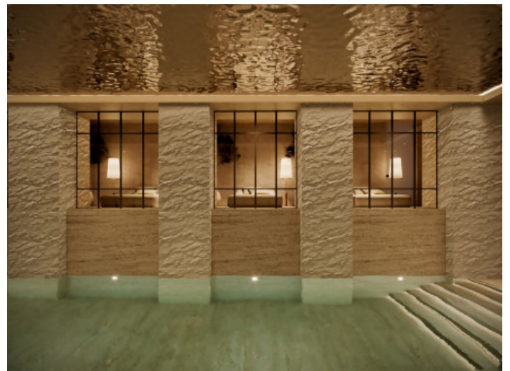
SPA and pool

All information is correct to the best of our knowledge. Errors and prior sale excepted. This prospectus is purely for information purposes. Only the notarized deed of sale is legally binding.