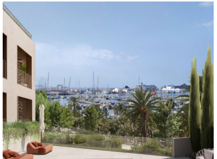
Terrace with Harbor View